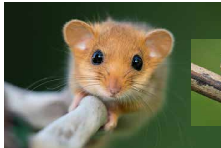
Left - Hazel Dormouse Below - Buff-tip Moth