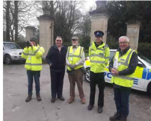
Community Speed Watch Volunteers keeping the village safe and aware of our activities.

Then on Friday the 9th February we restarted on High Street. 39 vehicles counted with 20 in excess of the 20mph speed limit. 52% in excess off the 20mph speed limit regardless of the limit being clearly