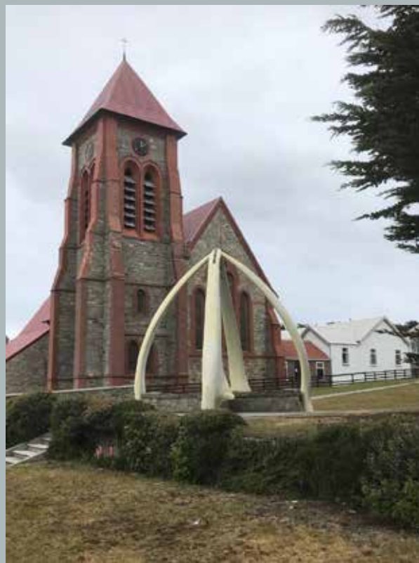
Stanley Cathedral - The Southernmost Anglican Cathedral on the planet

Over the duration there were a lot of people who'd gone out of their way to make our trip such a momentous one so our penultimate evening was spent extending our gratitude by entertaining them and their families at a restaurant in Stanley. An evening of mixed emotions as we say our goodbyes to friends old and new. On our final day four of us decided to drive the short distance to Wireless Ridge where we parked the vehicle and walked to Mount Tumbledown.