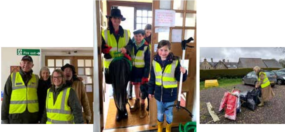
1st. April Fools Day

I awoke on Saturday morning full of the joys of spring and enthusiasm ready to start the Litter Pick, thought Oh! It's 1st, April Fools Day, it's going to be a good, positive fun day. Looked out the window and it's raining. Bah! That's going to spoil the day.