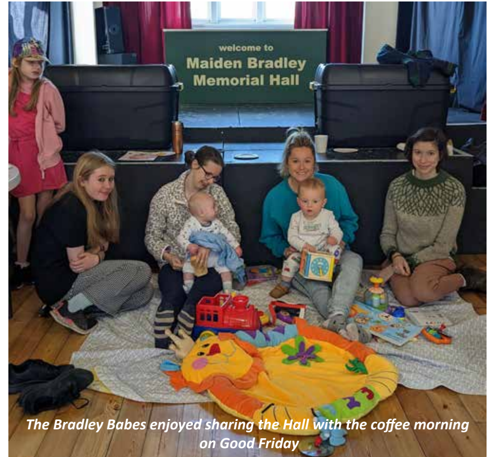
The Bradley Babes enjoyed sharing the Hall with the coffee morning on Good Friday

Book library available during hall opening Friday mornings