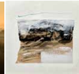
L to R: Deb Barnes and Tonia Gunstone venue 44 - The Old Chapel