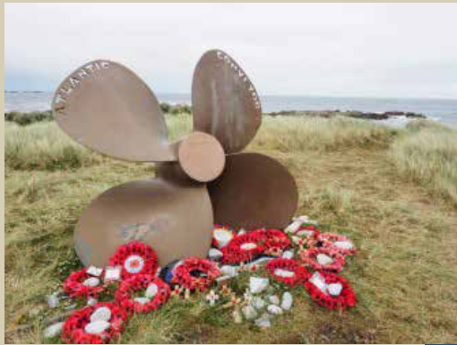
Above is the memorial to those onboard Atlantic Conveyor.

Other trips took us to Bluff Cove (actually it's Fitzroy..) where the two RFA's Sir Galahad and Sir Tristram came to grief resulting in a high number of casualties. Perhaps because of the circumstances and the wholly unnecessary loss of life but the memorial to those casualties is particularly moving and it must have become quite smokey as we stood by and read the names as I wasn't the only one wiping my eyes.