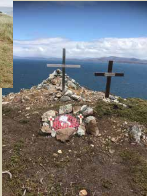
Right is of our replacement cross alongside the original at Fanning Head.