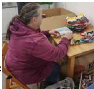
Please wash before bringing, no dirty or smelly items please!! People are sorting this rubbish by hand.

To check on what you CAN recycle in your household blue bin, this link has a clear list.