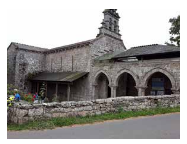
Church of Knights' Templar

basic standard and prices around 12 euros for a three course meal with bread and a drink. A drink could be a bottle of wine. I ate alone for the majority of the time except when meeting up with Michelle or Alice, fellow pilgrims.