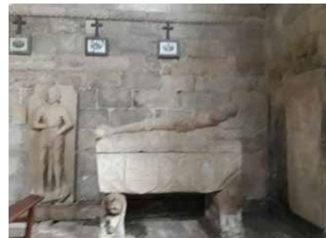
Inside the Church of Kniahts' Templar

many stones were just the names of people or with hearts drawn on them. An overwhelming feeling of sadness came when I thought of the hope for loved ones that the pilgrims had attached to their stone. A small group of Americans from Tennessee were saying prayers at the cross and one very dark morning, I attached myself to their group, just to have some company until the breakfast café loomed and light returned. They comprised of an Aunt, nephew, niece and friend walking part of the way. They were the only Americans