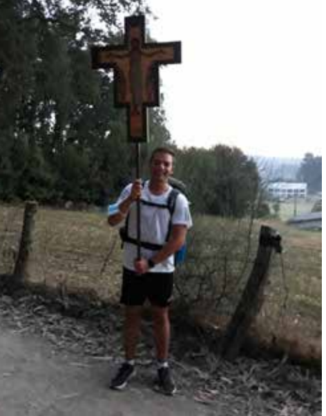
Pilgrim carrying a cross

The average distance I walked each day was 12 miles. Occasionally I would walk less and on the longest walk, I managed 18 miles mostly uphill and climbed the equivalent of Ben Nevis. The terrain on the whole of the section from Leon is easy underfoot except on one ridge in the mountains where the rock formation meets the path. No one told me just how beautiful this mountainous region would be. No rugged rock formations, more like tall rolling hills with u shaped valleys and covered with vegetation, the lower slopes transformed into fields.