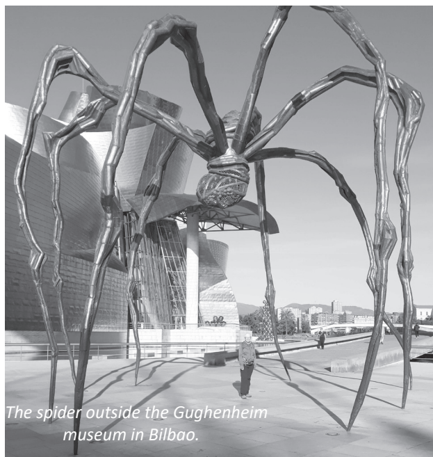
The spider outside the Gughenheim museum in Bilbao.

My long-distance dusty boots are now on the shelf for another year. We completed 210K in ten days and have another 312K still to walk with mountainous trails ahead.