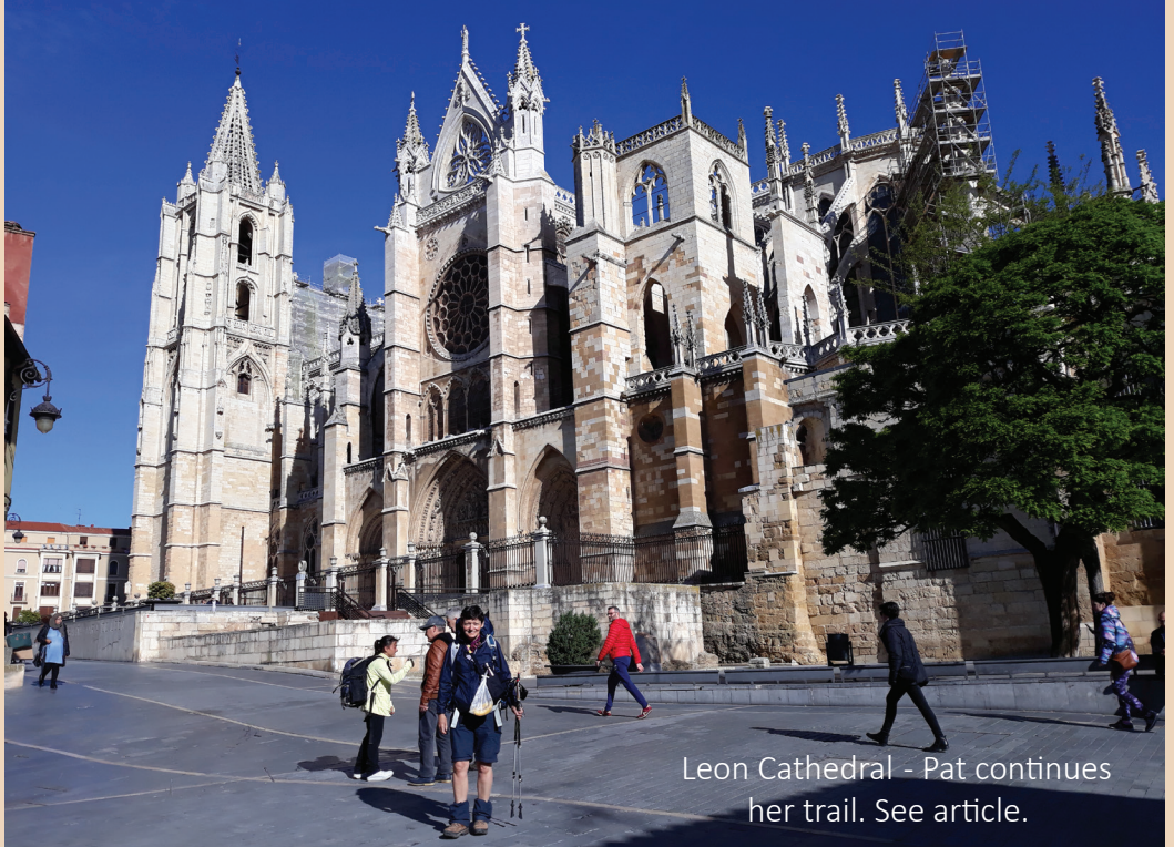
Leon Cathedral - Pat continues her trail. See article.