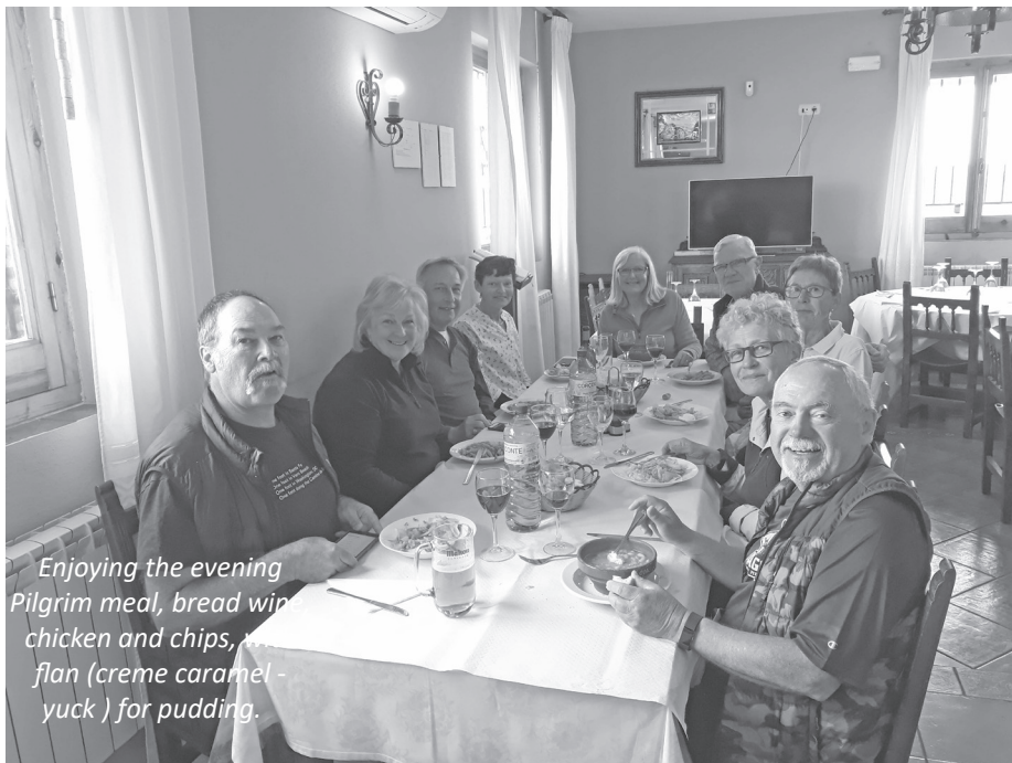
Enjoying the evening Pilgrim meal, bread with chicken and chips, waffles, flan (creme caramel - yuck ) for pudding.