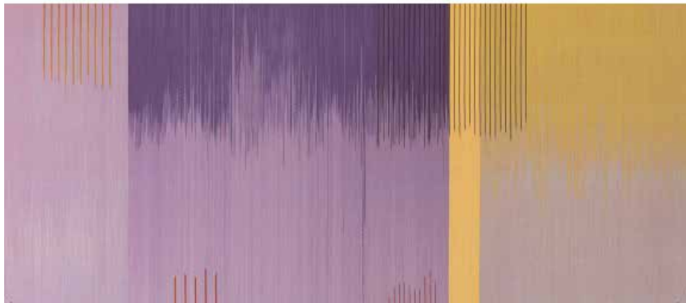
Top: Nazca Feather Tunic (Rainbow Colour). c.200 AD, Nazca culture, 132 x 177 cm Bottom: 'Violet Yellow 2' 2019. 80 x 120cm. hand dyed and woven viscose

WE WOULD LIKE TO INVITE ALL MAIDEN BRADLEY RESIDENTS TO VISIT THE EXHIBITION PREVIEW. 31 JULY, 16:00-20:00.