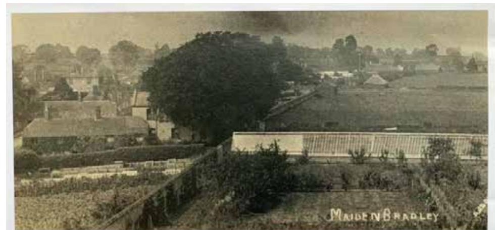
Window on the past From the Maiden Bradley Parish News April 2010 but the picture is from much longer ago

If you would like to join whether you are a complete novice or a Gardener’s World regular, we would love to hear from you. There are no allotments available at the moment but there is always room for more people in the community side of the garden.