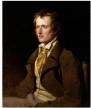
John Clare by William Hilton, oil on canvas, 1820

Is there another world for this frail dust To warm with life and be itself again? Something about me daily speaks there must, And why should instinct nourish hopes in vain? 'Tis nature's prophesy that such will be, And everything seems struggling to explain The close sealed volume of its mystery. Time wandering onward keeps its usual pace As seeming anxious of eternity, To meet that calm and find a resting place. E'en the small violet feels a future power And waits each year renewing blooms to bring, And surely man is no inferior flower To die unworthy of a second spring?